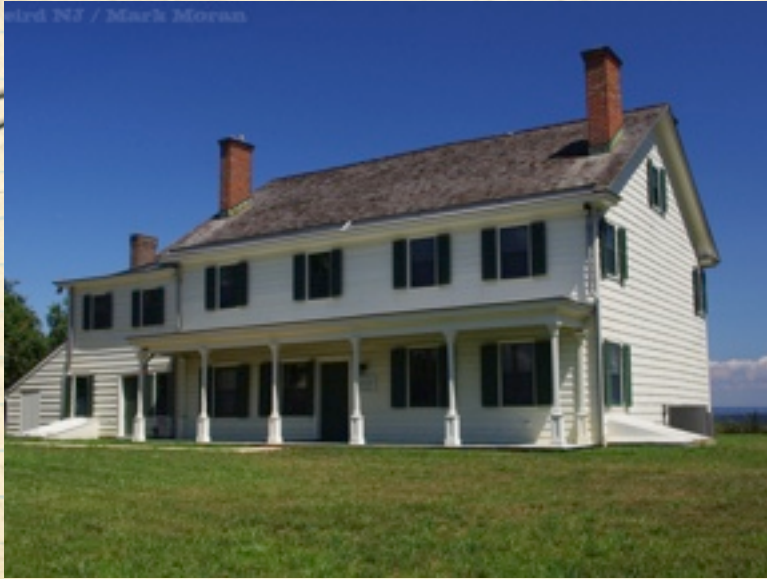
The Spy House in Port Monmouth

You may not believe this, but at the Atlantic Highlands Memphis Pig Out, which is held every year, there is a ghost named Bubba. He shows up and scares people. You can learn more about it from the weird NJ magazine.