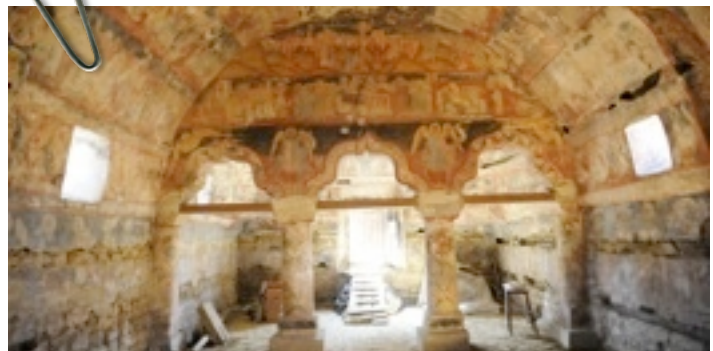
Frescoes cover every surface inside the Causeni Church.

The fact that makes this church unique is its construction. The church is half-buried into the ground. The reason for this comes from a legend that dates back to time when the Tatars were living on the territory. The Tatars are a mainly Muslim group that can trace its origins to the days of Genghis Kahn. It is said that the Tatars admitted the construction of a Christian church with the condition that it would be the height of a man riding a horse. The only way to accomplish this was by burying a portion of the building.