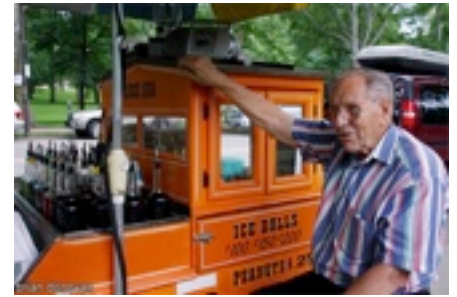
Owner of Gus and Yia Yia's will treat you right in the summer.