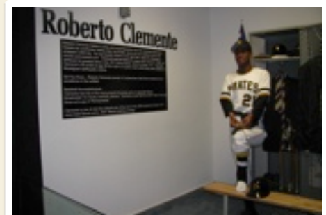
The Roberto Clemente Museum is sure to inspire you.

Pittsburg is full of local history. The people of Pittsburg really make the history come alive. The famous, and not so famous, make this a special place to live.