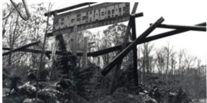
The sign over the entrance to Jungle Habitat.

In the town of West Milford, there is a place called Jungle Habitat. It is an abandoned zoo which was originally part of the Six Flags family in Jackson, New Jersey. This was sponsored by Warner Brothers. The park opened in the summer of 1972, but was closed four years later in the fall of 1976. During its brief time open, people could drive through the park and see animals such as elephants, lions, and baboons, many of which would approach or climb on the cars. After it was closed, people reported seeing kangaroos, monkeys, and other non-indigenous animals in the Northern New Jersey region. Most of this information was false rumors, but people did find dead bodies of animals in the forest. Today, people can enter the zoo through the main gate, which is still standing, and walk around the park safely. They can even see the empty cages and food stands that the people of Six Flags left behind. There are about twelve miles of trails in the park which are open to foot traffic or bicycle use.