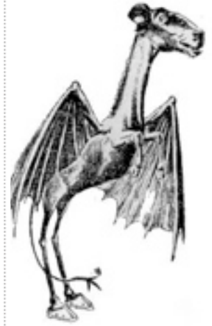
Supposed image of the New Jersey Devil.