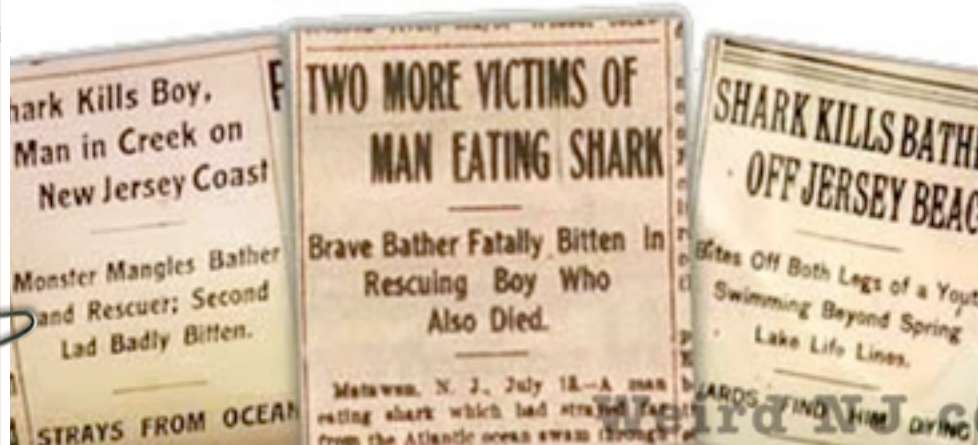
Newspaper headlines from real life shark attack in 1916.

To find out more about what happened, click here to read the rest of this story on weirdnj.com.