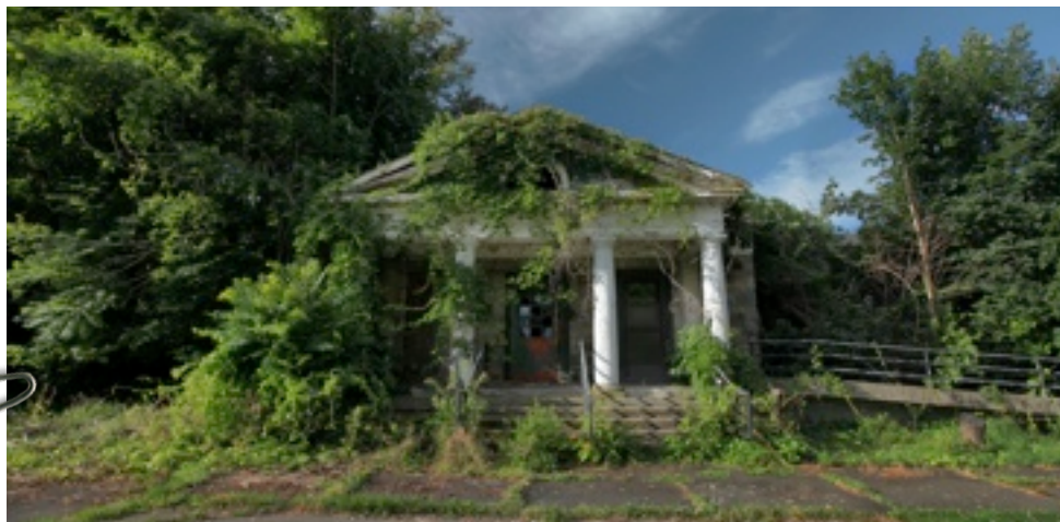
The buildings are being overgrown in the Village.

To read more about the Village, please click here to see our presentation.