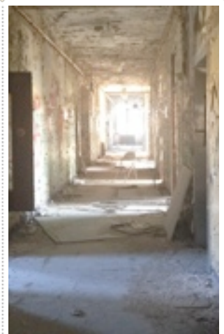
One of the abandoned hallways.