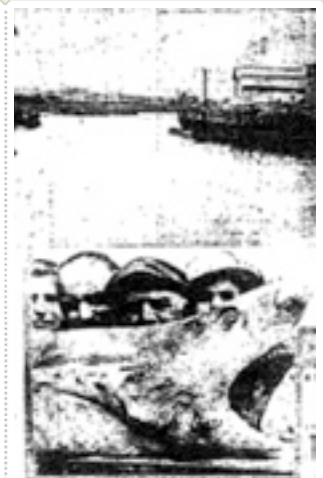
Photo of the rogue shark and his killers.