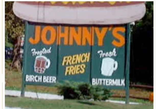
You can get delicious food here, and make some nice family memories.

To sum up, Hotdog Johnny's is really popular as you can tell. I love living close to this place just to hear the stories of how many people enjoy it. If you want to have a nice time with your family and have a good hot dog, come to Hotdog Johnny's.