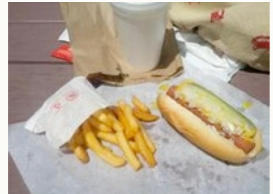
Enjoy a hot dog, fries, and a birch beer outside on the patio.